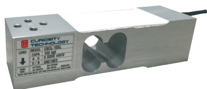
60L ~ 200L