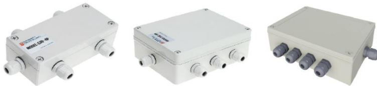
CJB - 8P